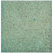
ASHTON GREEN Gloss Varied Glaze