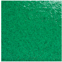
BOWLAND GREEN Gloss Varied Glaze