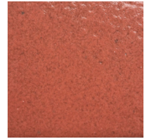
PENWORTHAM PINK Gloss Varied Glaze