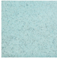
LYTHAM BLUE Gloss Varied Glaze