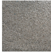
GARSTANG GREY Gloss Varied Glaze