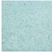
LYTHAM BLUE Gloss Varied Glaze