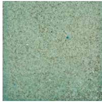
ASHTON GREEN Gloss Varied Glaze