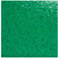
BOWL LAND GREEN Gloss Varied Glaze