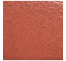
PENWORTHAM PINK Gloss Varied Glaze