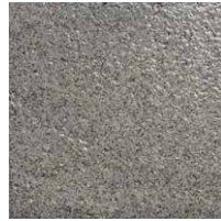
GARSTANG GREY Gloss Varied Glaze